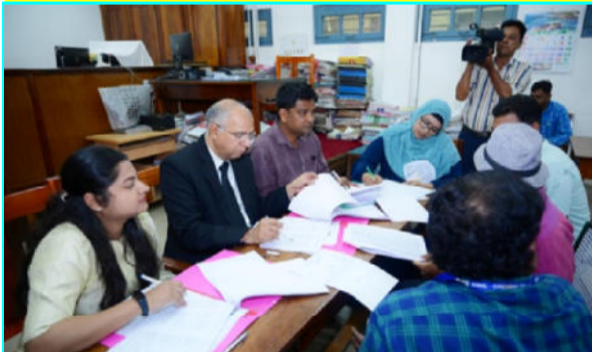
Lok Adalat at Port Blair