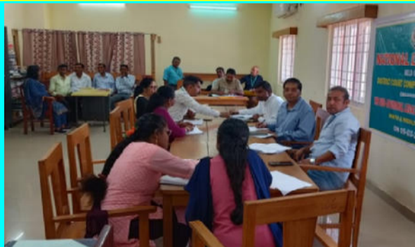
Lok Adalat at Mayabunder

Port Blair, Mar. 9 The District Legal Services Authority, Andaman & Nicobar Islands held National Lok Adalats in the District Court Building, Port Blair, ADR centre- 'PRAYAS', Port Blair and Sub-Divisional Court Complex at Mayabunder and Diglipur today. The Judicial Officers of this judgship were present to